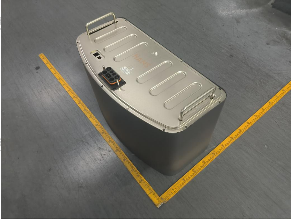
Figure 1 Overall view I of battery