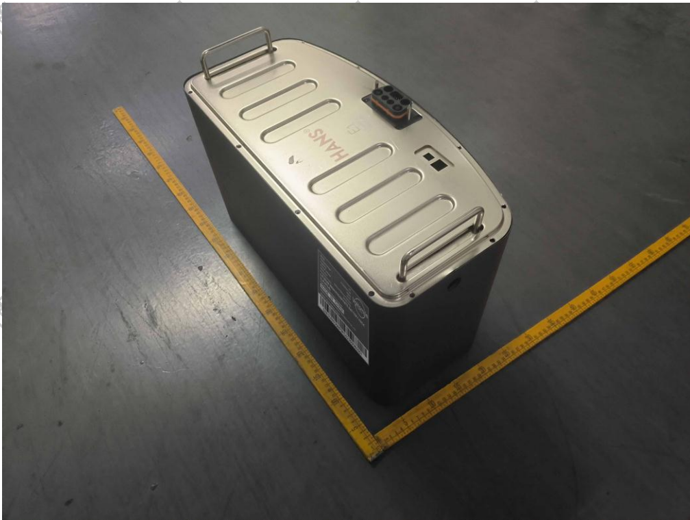
Figure 2 Overall view II of battery