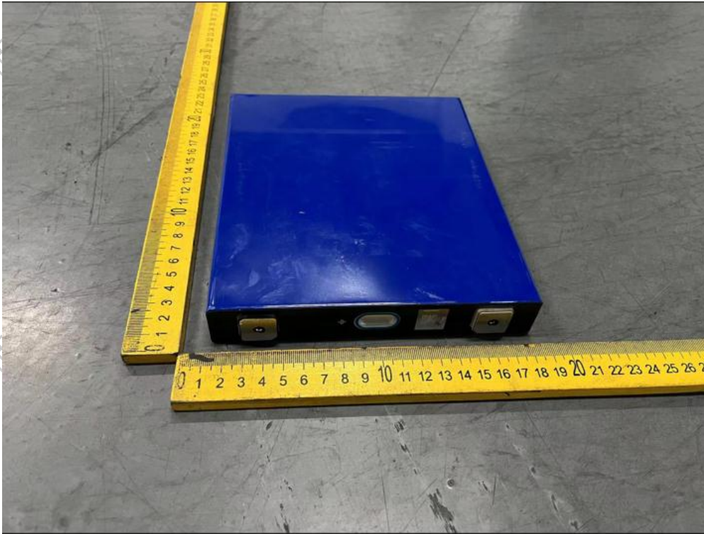
Figure 3 Overall view of cell