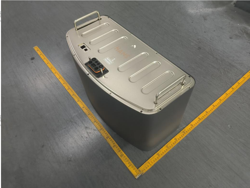
Figure 1 Overall view I of battery