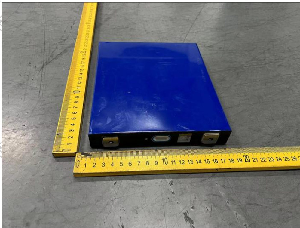
Figure 3 Overall view of cell (电芯图)