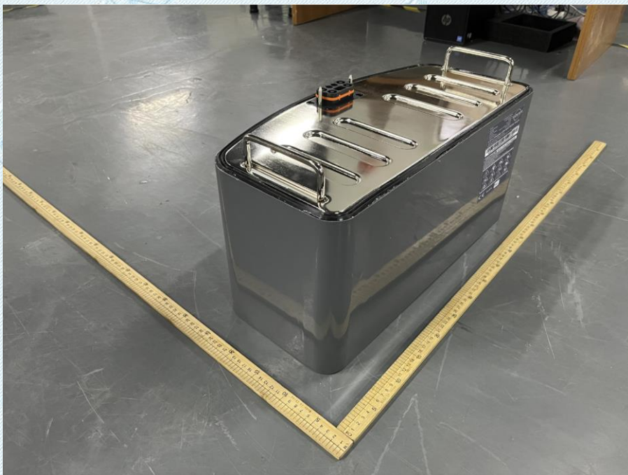
Figure 2 Back view of battery