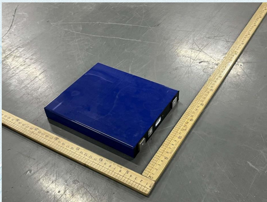
Figure 3 Front view of cell