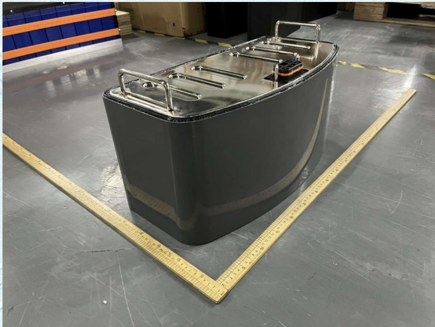
Figure 1 Front view of battery