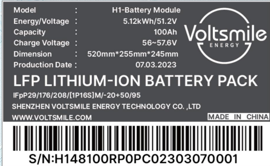
Figure 5 Label view